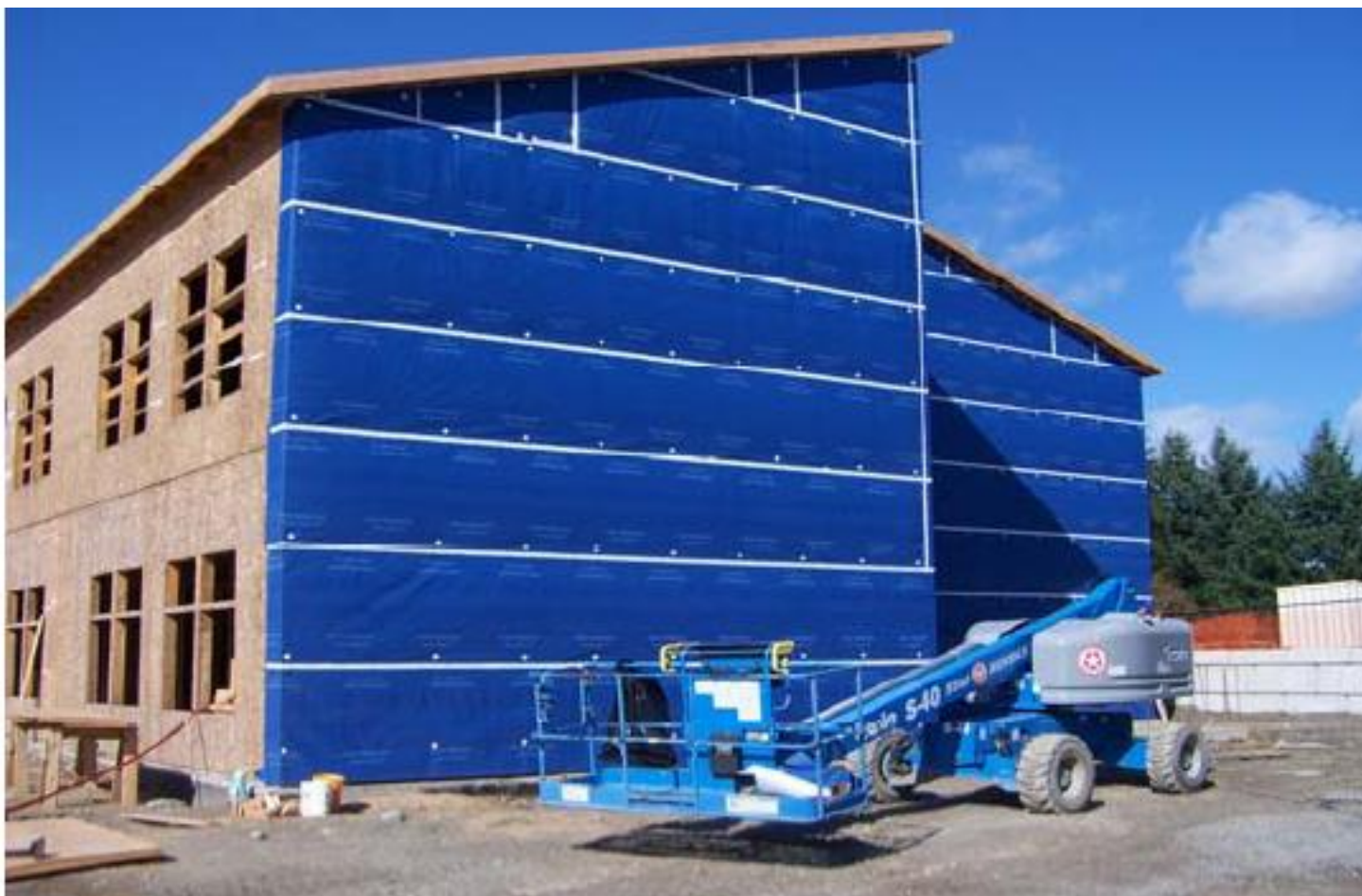
Future home of the Collins Coyotes

Although our schoolhouse is aging (after all, some of it was built in 1937), it has been well-maintained to the best of our ability. We are thrilled that our voters passed a bond that will be used, in part, to build a new school for Collins students. Progress is going well at our new site and we are on schedule to start school in the new building in the fall of 2020.